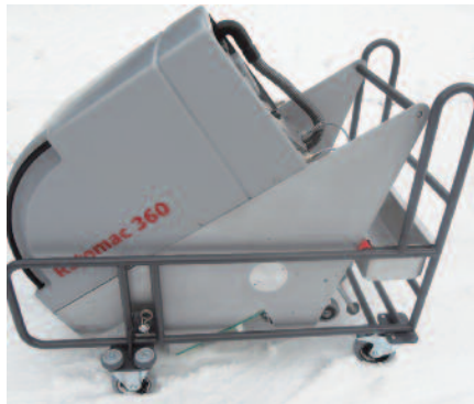
The new Rotomac 360