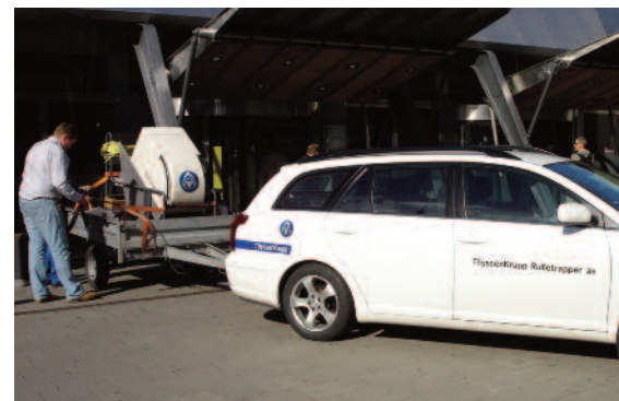
The Rotomac 340 in use at ThyssenKrupp