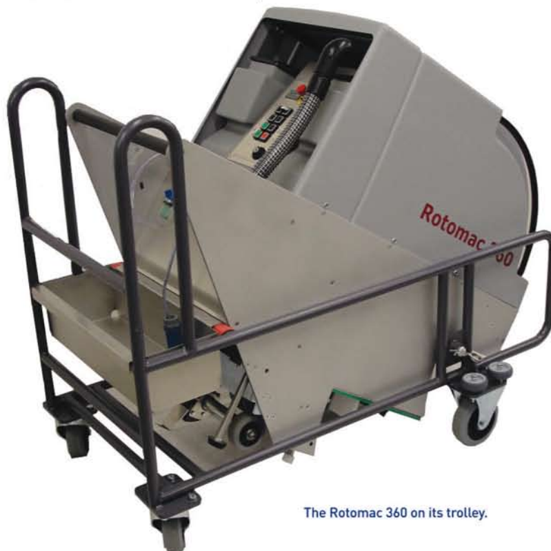
The Rotomac 360 on its trolley.